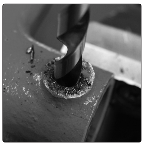
4.1 Drill out the damaged thread using the correctly sized twist drill bit provided.