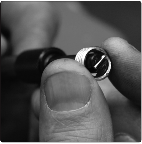
4.3 Load thread insert into installation tool.