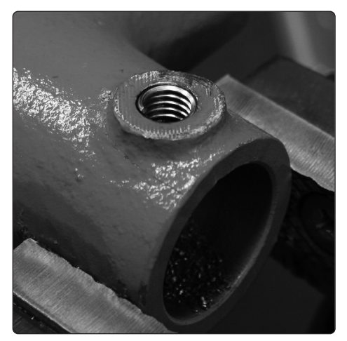
4.6 Thread is repaired and ready to use.