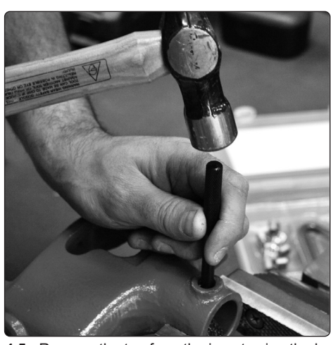
4.5 Remove the tag from the insert using the breaking pin tool.