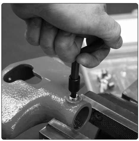
4.4 Screw insert into threaded hole.