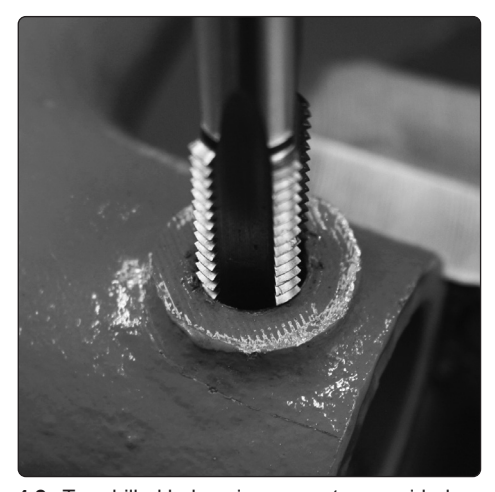
4.2 Tap drilled hole using screw tap provided.